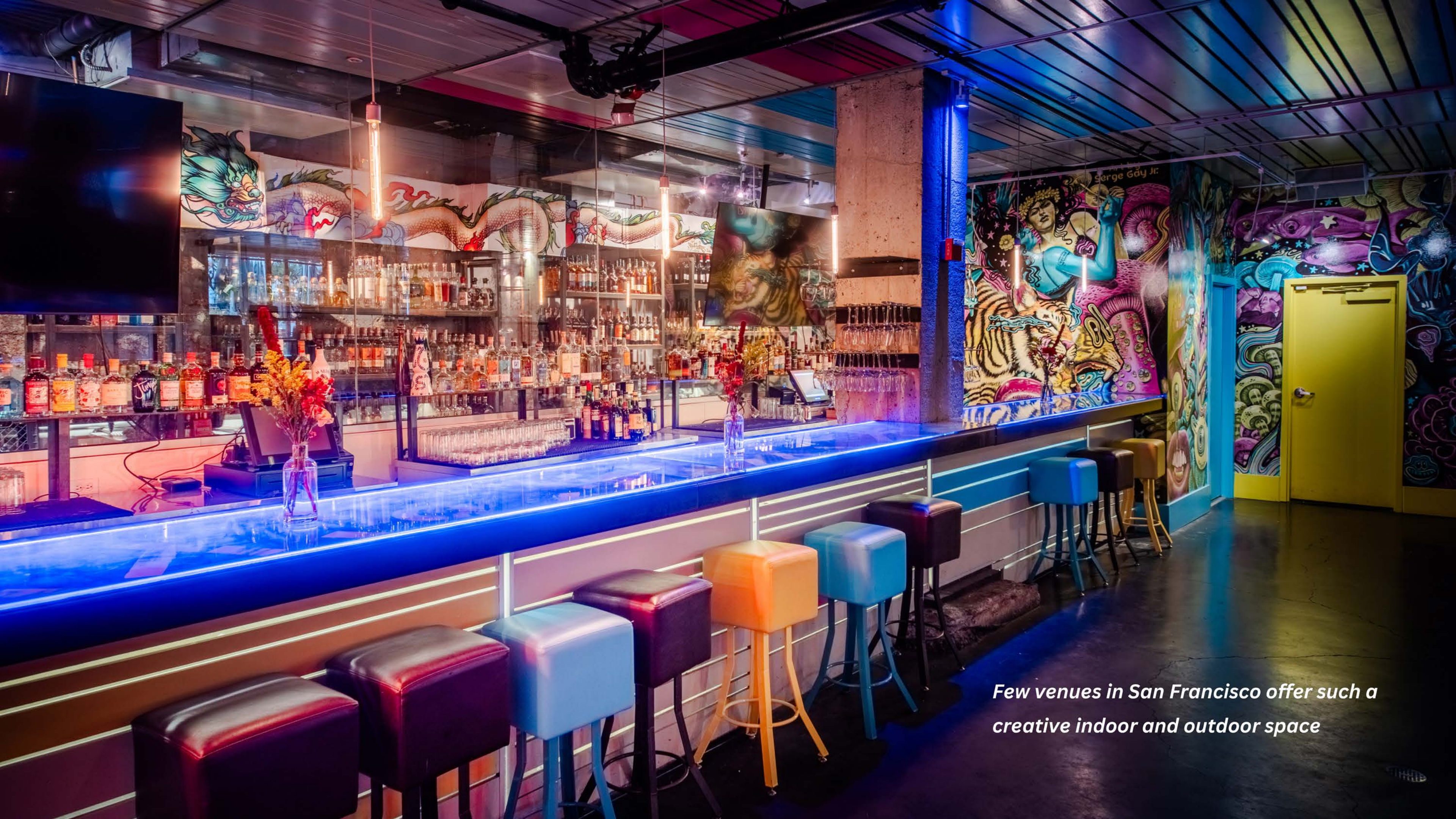
Few venues in San Francisco offer such a creative indoor and outdoor space